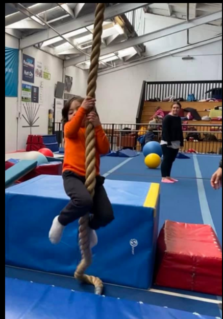
Having fun at the Explorers Open Day