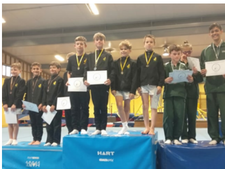
Capital Champs Competition Placements

We also wish the MAG Team the best of luck for the season as they work hard to qualifying towards Nationals in July.